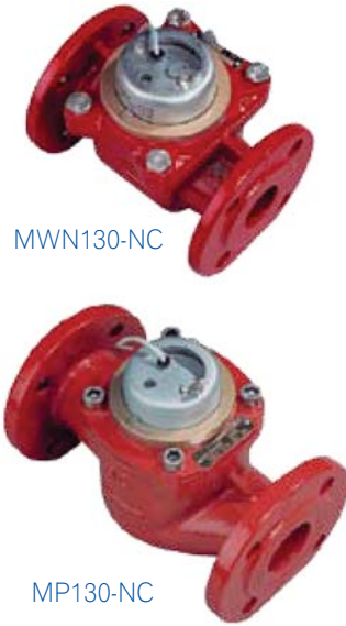
Tabela 15. BASIC TECHNICAL CHARACTERISTICS