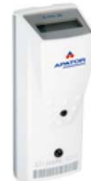
Tabela 17. BASIC TECHNICAL CHARACTERISTICS

Designed for counting the costs of room heating with heating systems. The recommended range of usage in vertical or horizontal heating system with one or two pipes with the average minimal temperature of the heat carrier \geq 35^{\circ}\text{C} and max \leq 90^{\circ}\text{C} .